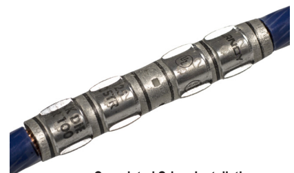
Completed Crimp Installation