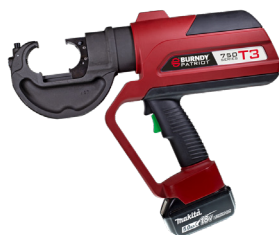
750 Series Tool